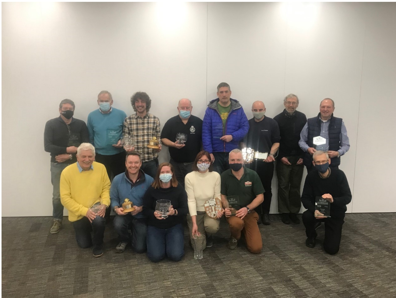
The 2021 Clubmans Championship Award Winners. What a motley bunch! Many Congratulations to all who had success last year

Hopefully the 2022 season's awards presentation will be back in its usual slot next year.